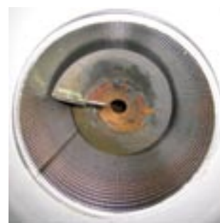
Interior view of the press pipe in Wedge Weir and spiral in black material, S355J0.