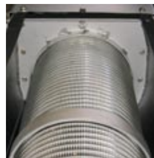
Screw presses from Läckeby Products are fitted with an inspection hatch for the press unit, and replaceable press pipes.

The press unit is equipped with an inspection hatch to make maintenance simpler and enable flushing of the press pipe. Flexible attachment of the press pipe in the press unit makes press pipe replacement easier. The spiral is fitted with a brush at the drainage to minimise the risk of clogging. As standard, screw presses are made in stainless steel or acid-proof steel with Hardox wear bars. Spirals are made of black material as standard, but are also available in stainless steel.