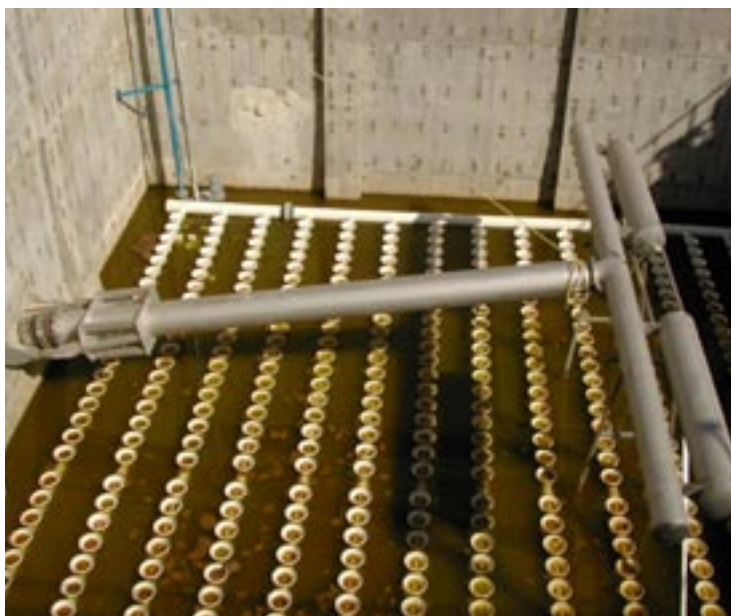
A decanter from Läckeby Products installed at Buenaventura, Chiapas in Mexico.

As standard, decanters are manufactured in stainless steel or acid-proof steel. The outlet pipe is equipped with a flexible joint at the lower end. This solution also includes support for the decanter when draining the SBR tank. The decanter from Läckeby Products requires minimal maintenance, as it has no pumps, valves or electric operations.